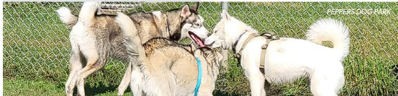
PEPPERS DOG PARK