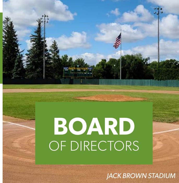
JACK BROWN STADIUM