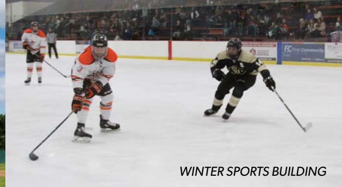
WINTER SPORTS BUILDING